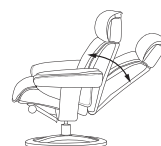
EFFORTLESS RECLINING MECHANISM