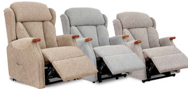
GRANDE STANDARD PETITE

The range includes 3 'Tailored-to-Fit' recliner sizes, Grande, Standard and Petite, all designed to maximise comfort and support. These recliners are available in up to 6 actions.