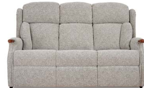
FIXED 3 SEAT SETTEE

Canterbury models are also available without a knuckle