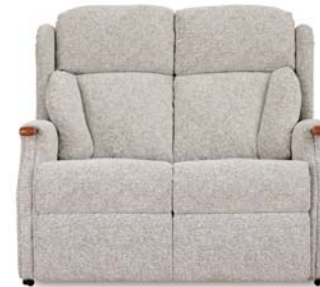
FIXED 2 SEAT SETTEE